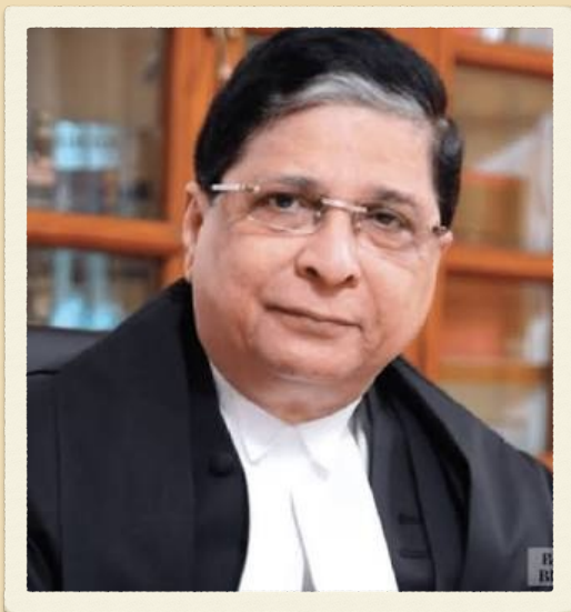
Hon'ble Mr. Justice Dipak Misra Chairman, Governing Council DSPP&G Former Chief Justice of India

The School shall be the University's interface for engaging with the wider community of academics and practitioners in initiating, developing and sharing ideas to address various emerging domestic and international public policy challenges. More important, the School shall fill the existing void in building a specialized and efficient cadre of professionals dedicated to public service in India.